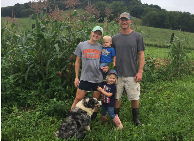
Grow Your Own Participants

Appalachian Sustainable Development (ASD) is recruiting for the 2020 Grow Your Own program which empowers families to grow their own food and earn income from home grown produce sales. Since 2012,